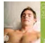
bloke 1 hour $110 footbath, muscle-melting body massage designed specifically for men.