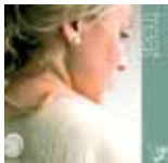
treat 3 hours $300 footbath, body cleanse, body brush & clay cocoon. body massage, facial.