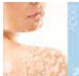
body 2 hours $200 footbath, body brushing. warm oil body cocoon. scalp & body massage.