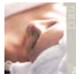
mind 1 hour $110 footbath, body brushing, moisturising body massage.