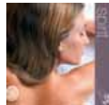
spirit 1h 30mins $160 footbath, shiatsu-inspired full body massage & cocoon. face, scalp & foot massage.